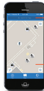
Staff Mobile App View

Quick search for single or group of assets