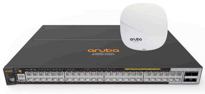
Aruba Instant Access Points and Aruba Switch Series

To avoid potential future bottlenecks, the Aruba 2930M and 3810 switch series allow you to raise the data rates to 2.5Gbps, 5Gbps, and even 10Gbps. With multi-gig HPE Smart-Rate capability these switches enable you to futureproof your network infrastructure as new, higher capacity wireless technologies emerge.